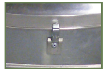
QUICK RELEASE LATCHES FOR EASY MOTOR ACCESS