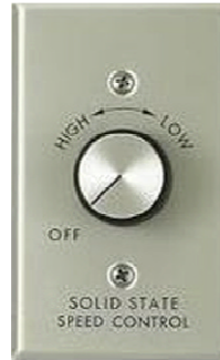
Model 100F Model 105F Model 277V-5 Model 277V-6