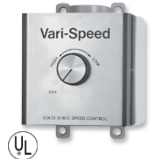
Model 200F Model 215F