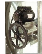
X-WING BELT TENSIONER

Optional 50 Hz motors are available with belt drive units.