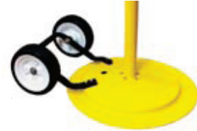
OPTIONAL WHEEL KIT