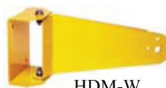
HDM-W WALL MOUNT