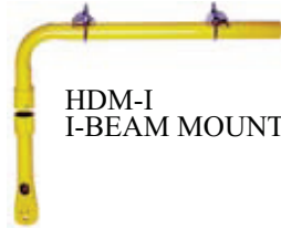
HDM-I I-BEAM MOUNT