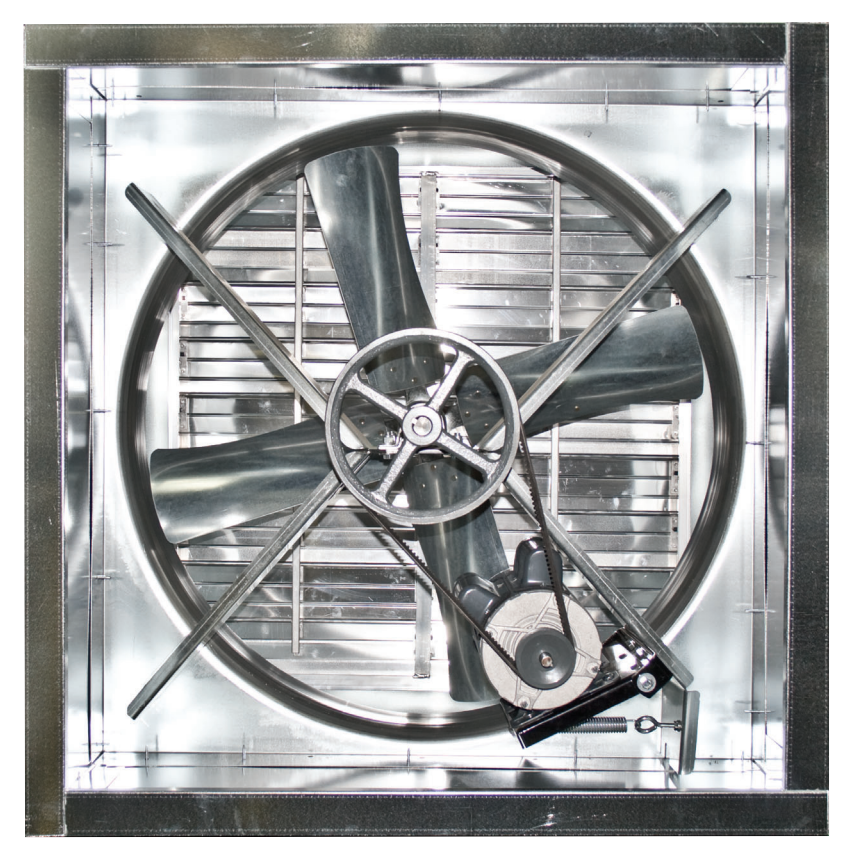
Heavy-duty X-frame · (Shown without rear guard for illustration purposes only)