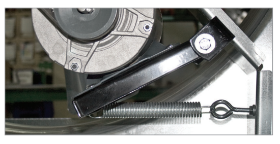
Belt drive models include a heavy-duty spring belt tensioner to reduce bounce at startup and provide uniform loading to increase the life of the belt and maintain high efficiency.