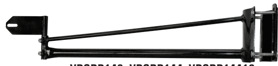
VRSBR143, VRSBR144, VRSBR14412