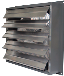
12" to 24" MODELS FRONT VIEW