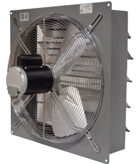
12" to 48" MODELS BACK VIEW

Canarm/LFI's standard fans follow a tradition of quality in design, materials and construction. All our standard fans are developed to be efficient and economically priced. Fans are available in single, two and variable speed models. All variable speed standard fans use an energy efficient variable speed, dual voltage motor and blade combination. To determine the proper Canarm/LFI fan for your applications, use the formula and table shown on back of page.