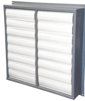
30", 36", 42" & 48" MODELS WITH PVC LOUVERS