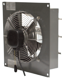
8" & 10" MODELS BACK VIEW