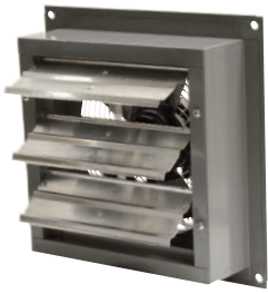
8" & 10" MODELS FRONT VIEW

Efficient, low maintenance and easy to install.