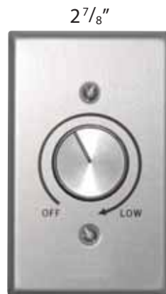
CN25 & CN5