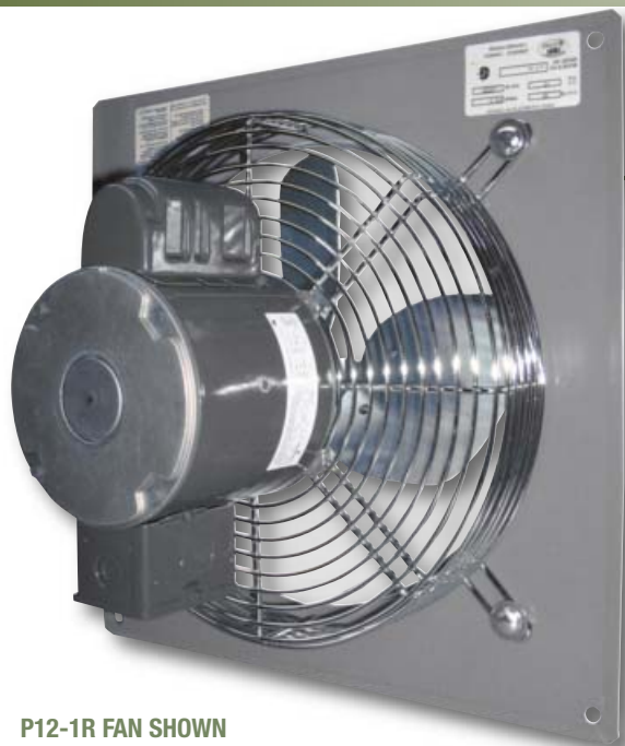
P12-1R FAN SHOWN