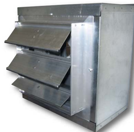
P12-1RS9M1115 FAN SHOWN COMPLETE WITH SLEEVE AND MOTORIZED DAMPER.

Designed for Industrial &amp; Commercial Supply applications.