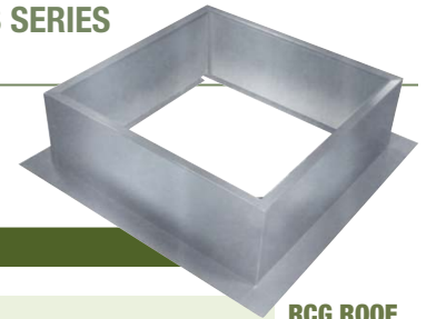
RCG ROOF CURB