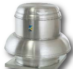
SB Belt Drive Downblast Spun Aluminum Exhauster