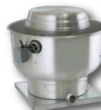
SDUB Direct Drive Upblast Spun Aluminum Exhauster