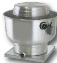
SBRM Belt Drive Upblast Spun Aluminum Exhauster