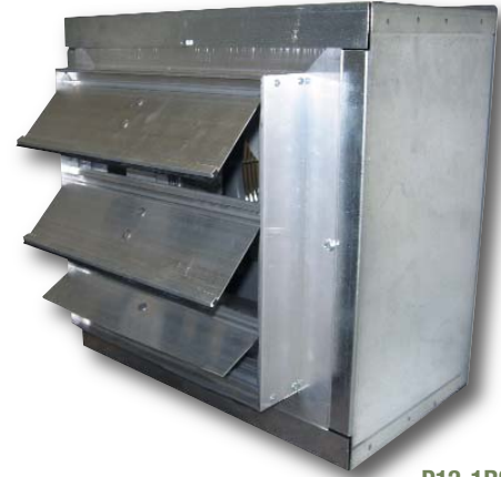
P12-1RS9M1115 FAN SHOWN COMPLETE WITH SLEEVE AND MOTORIZED DAMPER.

Designed for Industrial & Commercial Supply applications.