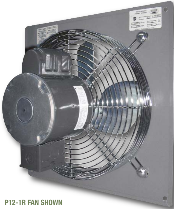
P12-1R FAN SHOWN