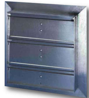
BACK DRAFT DAMPER

The Motorized dampers listed above are 110/230V. For 24V AC, replace X with Z.